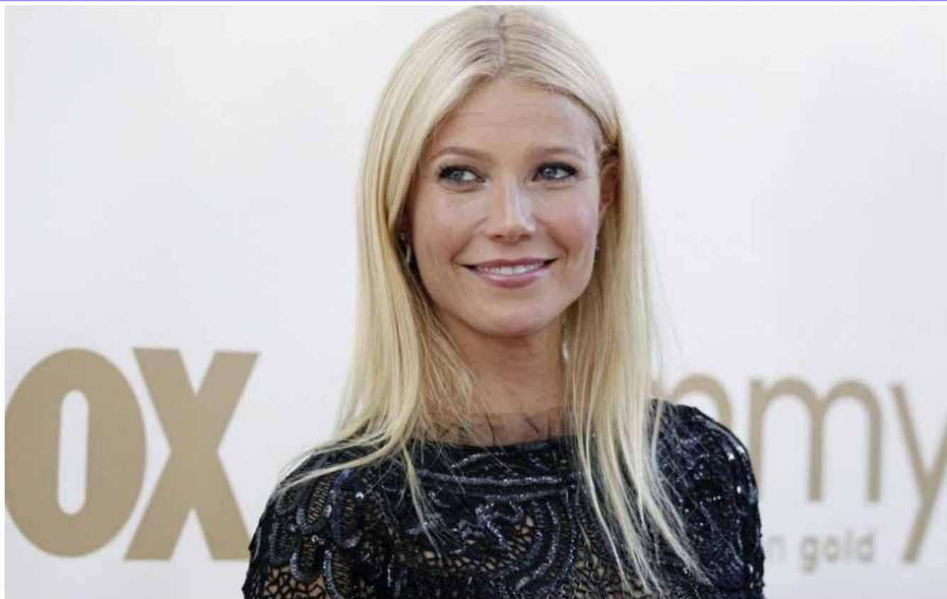
Gwyneth Paltrow is simply full of great ideas