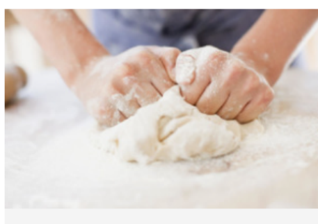
Artisan bread, anyone?

Topics Chelsea Handler Chloe Moretz easyjet Goop Gwyneth Paltrow Hamptons Long Island New York